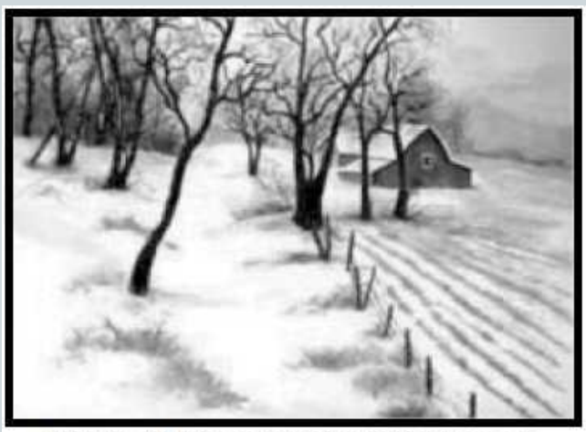
Figure 50 Minnesota in early summer.

From A Reformed Druid Anthology (2<sup>nd</sup> edition) Page 466. It's true, too!