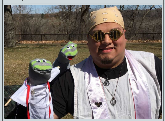
Sock puppets presided over ritual, 4/1/2017