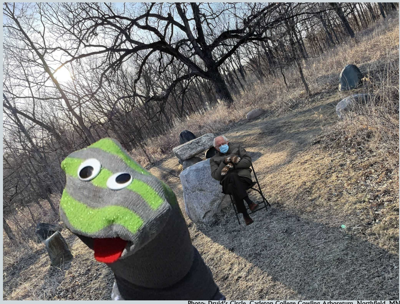
Photo: Druid's Circle, Carleton College Cowling Arboretum, Northfield, MN