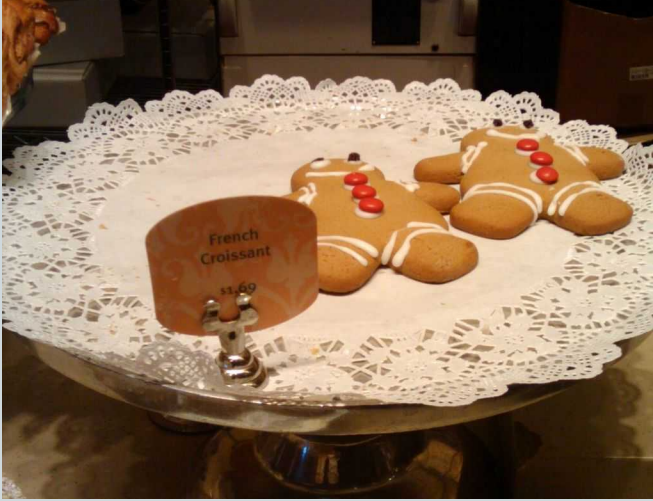
Panera doesn't know what French croissants are