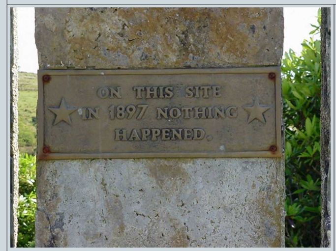
Important monument in Connemara, Ireland