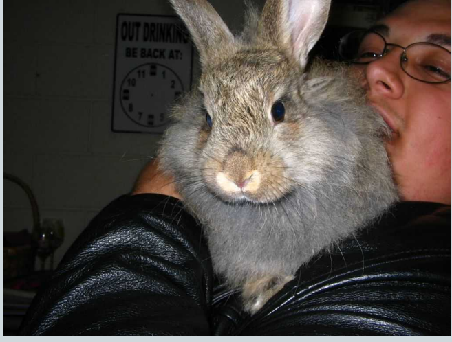
In college I once captured the Easter Bunny